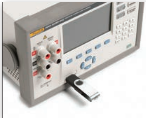
Easily transfer Super-DAQ data and setup files using a USB flash drive.

The Super-DAQ also includes two levels of data security to prevent unauthorized users from tampering with or forging test data or setup files. This security feature is especially important to industries that are regulated by government agencies where data traceability is required.