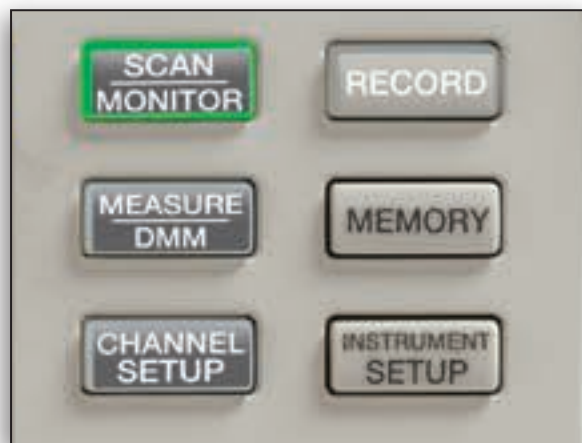
Scan, monitor, measure, and DMM function keys on the front panel.

Function keys are backlit so that you always know the mode of operation and recording status.