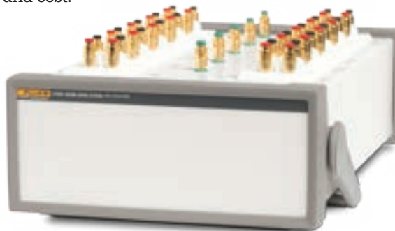
1586-2588 DAQ-STAQ Multiplexer

Universal input channels accepts 2-, 3-, or 4-wire connections to measure temperature, resistance, dc voltage, and dc current for data acquisition applications on the factory floor where channel count and scan speed are important.