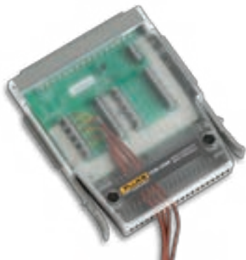
1586-2586 High-Capacity Module

For a calibration lab where accuracy is of primary importance, the Super-DAQ is best configured with a DAQ-STAQ Multiplexer. The external DAQ-STAQ features mini-jack thermocouple terminals—each with its own reference junction sensor—and patented mini-DWF, gold-plated input terminals, which accept bare wire, spade lug, or mini-banana-plug probe terminations. Easily connect and disconnect PRTs, thermistors, and thermocouples for benchtop temperature calibration. It can be stacked on the 1586A to reduce footprint in busy labs. Having the flexibility to configure the Super-DAQ for factory or lab use reduces your equipment needs and cost.