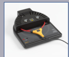
52120A/COIL6KA Coil, 50-turn, 6000 Amp