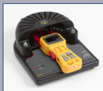
52120A/COIL3KA Coil, 25-turn, 3000 Amp